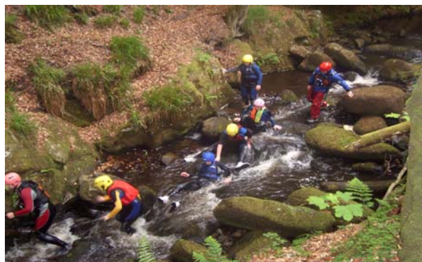
Where is my canoe? The LYCS adventure group enjoying a day out doing water sports

The junior leaders have and continue to be a valuable resource to the LYCS youth programme, they have supported the staff in the regular groups. They are positive role models to the younger members who look up to them and hope someday to become leaders themselves.