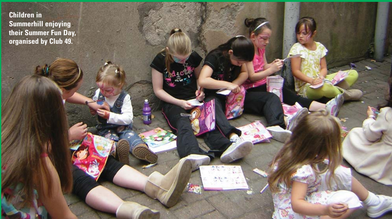
Children in Summerhill enjoying their Summer Fun Day, organised by Club 49.